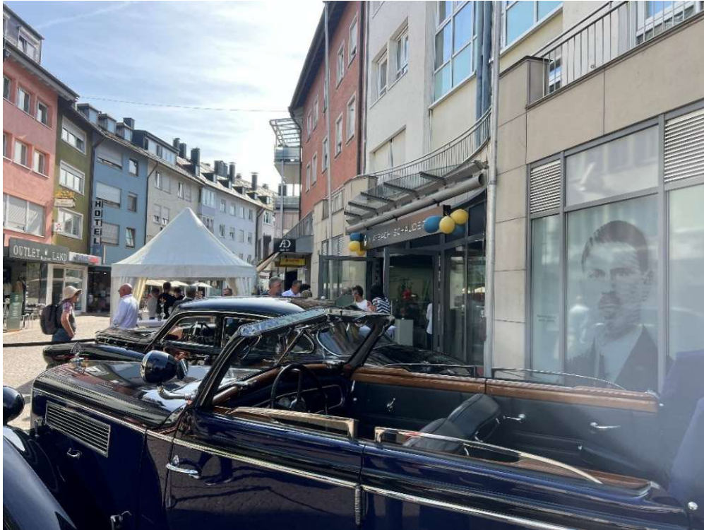
Classic Maybach cars parked in front of the Maybach Schaudepot welcome the first guests at the soft opening and draw crowds from the general public.